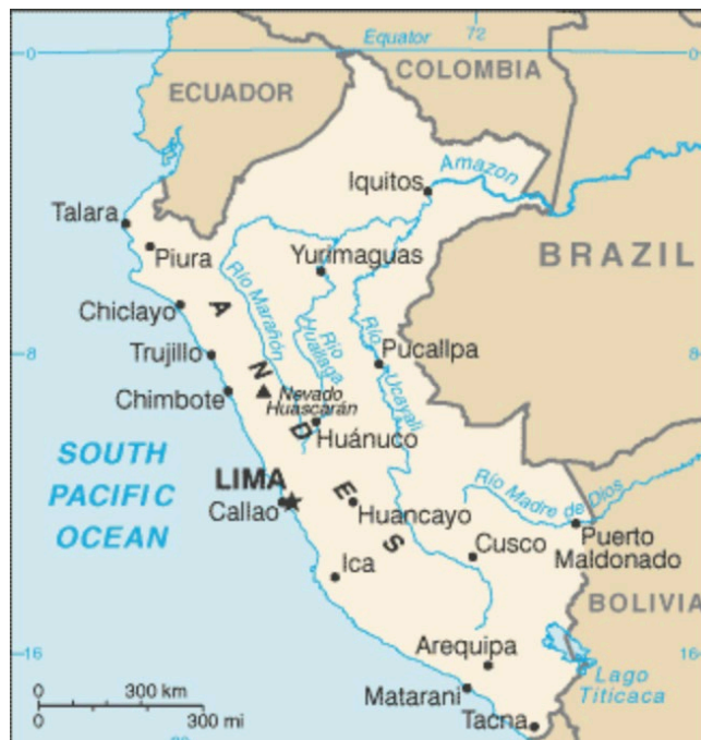
Figure 2: This map labels the major rivers of Peru (Central Intelligence Agency, 2018).

The rainforest is thick and dense with different foliage making the soil less fertile which forces people to move to the highlands for better soil (Davies et al., 2019). In addition to the heat and humidity, an average annual rainfall of 111.8 inches is recorded in Iquitos, which is located in the northern Peruvian Amazon (“Climate - Peru,” n.d.). One commonality of the three different ecosystems in Peru is that there are many rivers flowing throughout all of them. The rivers originate from the Andes mountains and empty into one of three larger bodies of water: the Pacific Ocean, the Amazon River, or Lake Titicaca (Sawe, 2017). Some of the major rivers include the